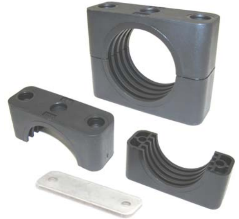
Shown with optional RSB-DP Plate

Personal injury and property damage can occur without proper installation